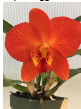
C. Chester – this is a true mini cattleya. Flower is about 5cm across and long lasting. Purchased from Paramount Orchids in 2018

AOS Judging - The Western Canada Judging Center (WCJC) meets every 2 nd Saturday of the month at 11:30am, except where noted. Everyone is welcome to attend and bring their orchids for consideration by the American Orchid Society Judges. This is a great opportunity to learn about the judging process and see many orchids of award quality. **Please bring your plants for judging – you may well have a plant that could be an award winner!