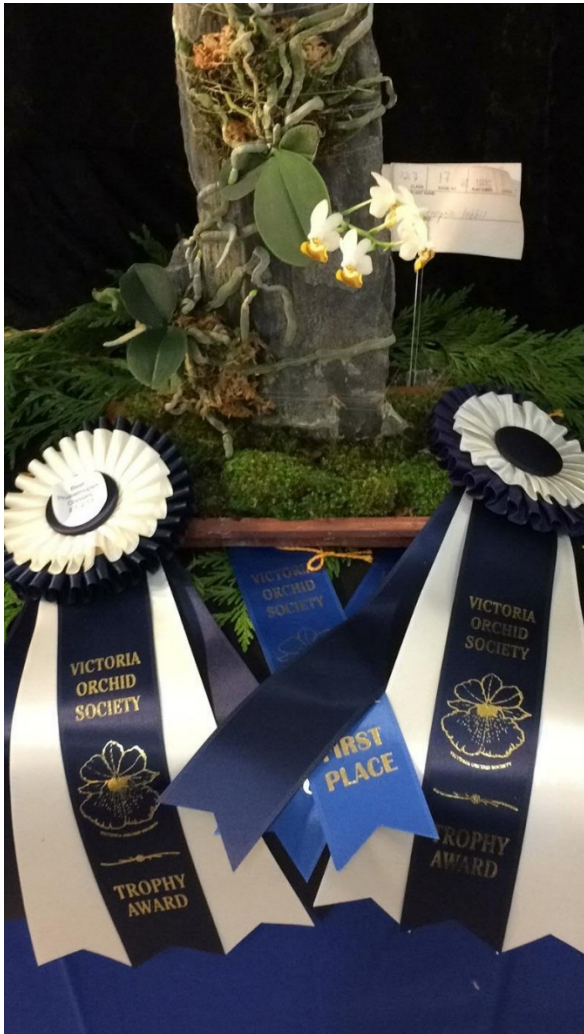
Best Phalaenopsis & Best Mini Display. Phal. lobbii. Daniel Kwok

Photoshop PSD file download - Resolution 1280x1024 px - www.psdgraphics.com