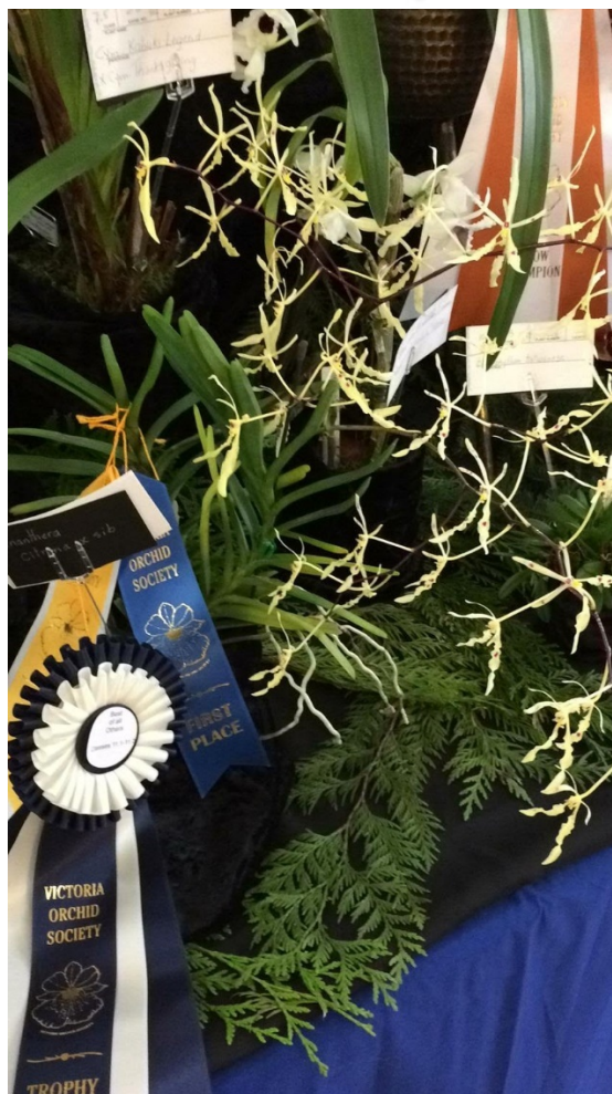
Best of all others & AOS nomination. Renanthera citrina x sib. Wayne Riggs