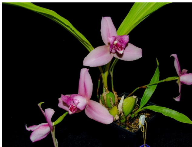
Lycaste Skinneri Ipala Guatamalensis x John Ezzy Pink.