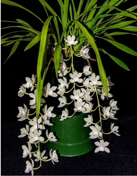
Cym. Sara Jean 'Ice Cascade'. Presentation and flower quality awards.