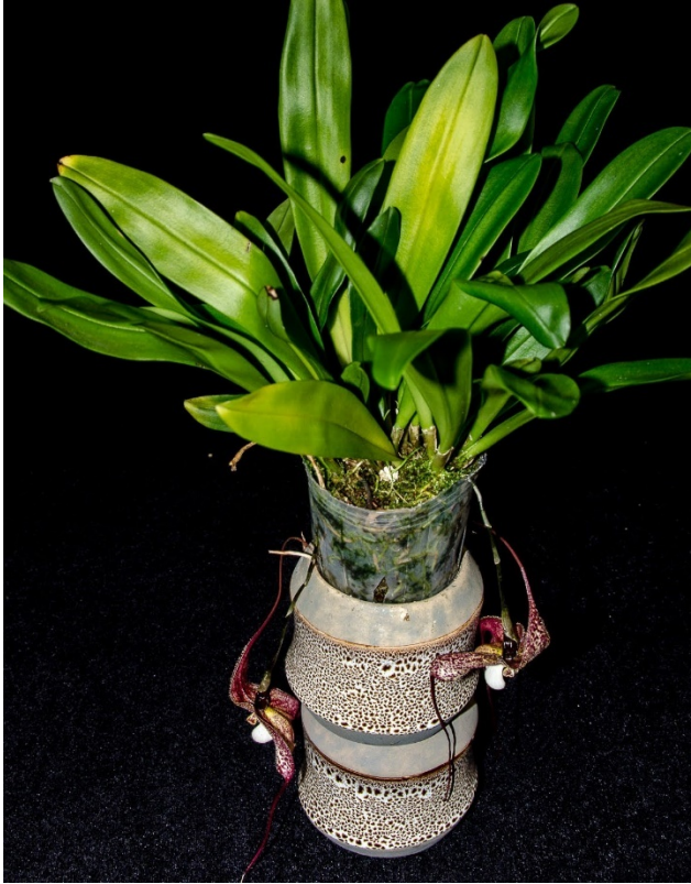
Dracula Bella. Plant culture and exotic flower awards.