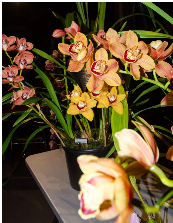
Group of five Cymbidiums. Display Award.