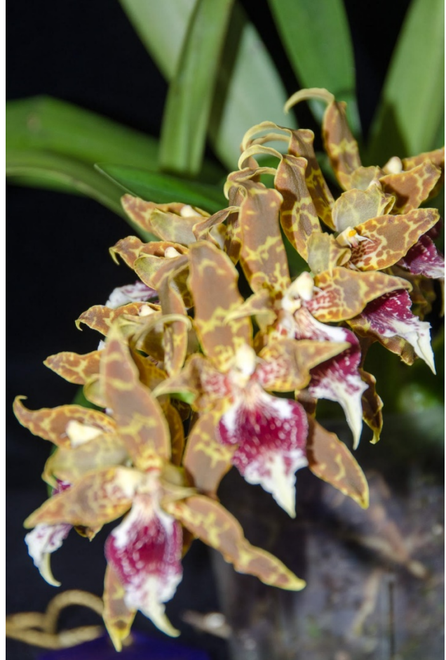
Ondont. praestans x hangianum. Hybrid and flower quality awards.