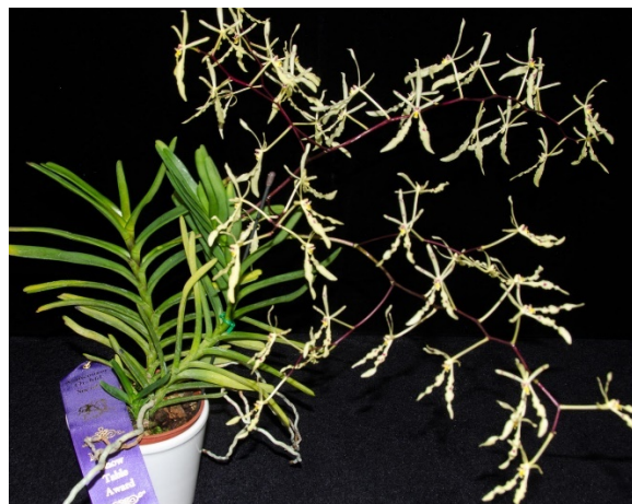
Renanthera citrina x sib. Unusual species and well bloomed awards.