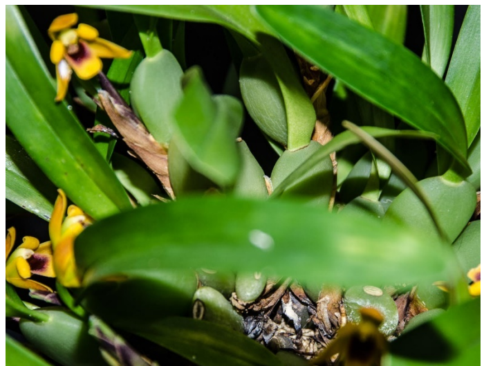
Maxillaria variabilis. Species and color form awards.