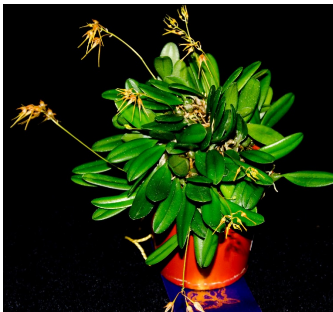
Bulb. Taiwanese. Species and plant culture awards.