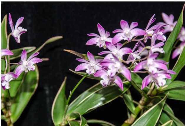
Den. kingianum variegata. Unusual species, plant culture and flower quality awards.