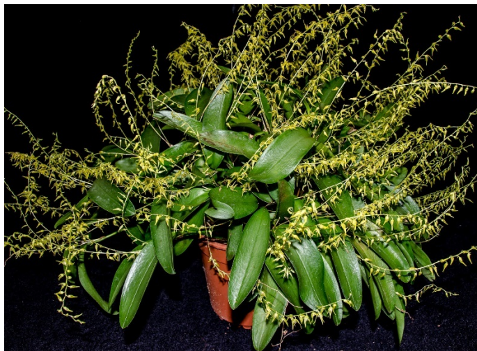
Pleurothallis angustipetala. Plant culture & species awards.