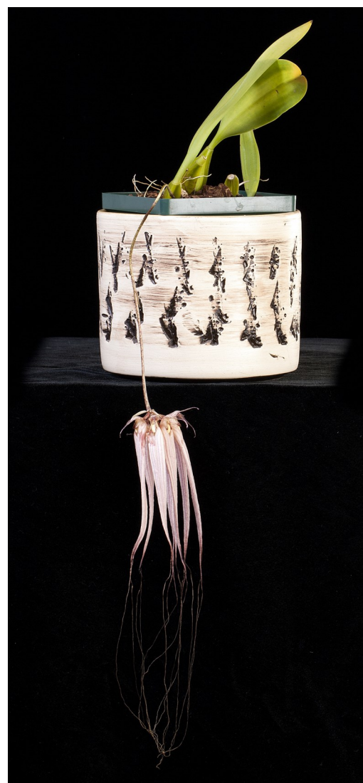
Unusual Species, Bulb. Longissimum, Exhibitor: Rob Elvidge

Every month show off your Orchids at our meeting!