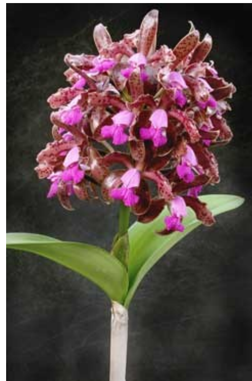
Cattleya tigrina grown and photographed by Greg Allikas