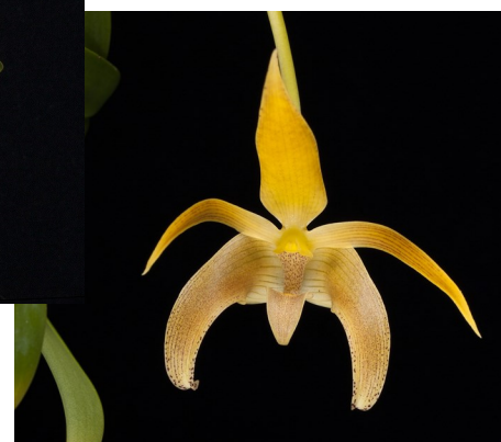
Best of Other in Dendrobium Alliance: Bulb lobbii Kathey's Gold AM/AOS,