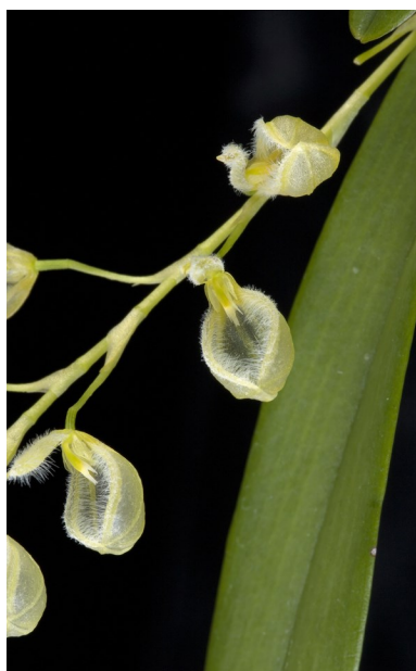
Best Orchid Mounted (slab, branch, etc.): Pleurothallis aparaona, Exhibitor: Carla Bischoff