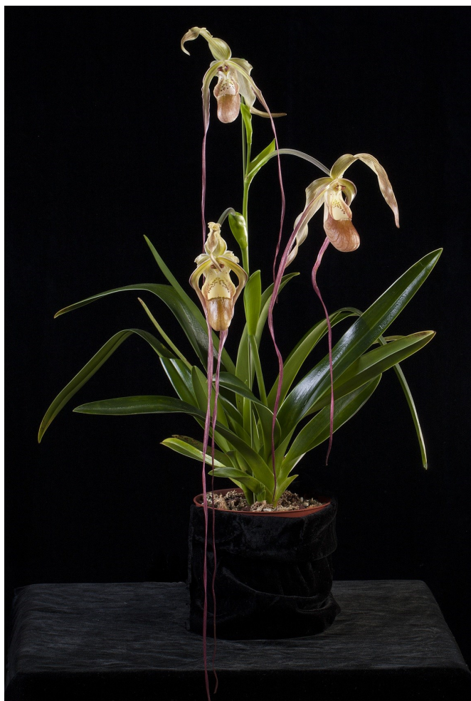
Members' Choice , Phrag. Grande 'Maybrook' , Exhibitor: Wayne Riggs