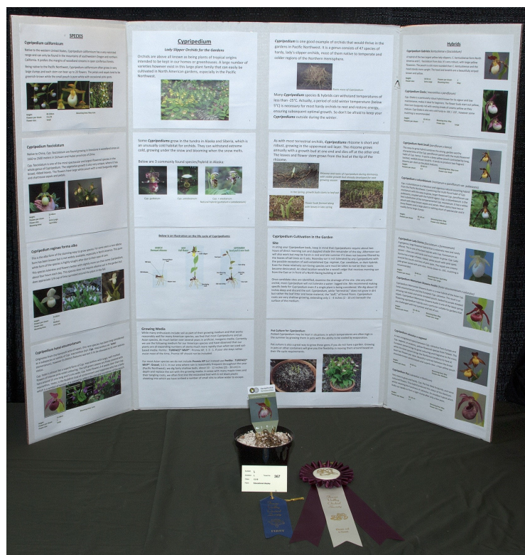
Educational Display: Tropical Garden, Exhibitor: Calvin Wong