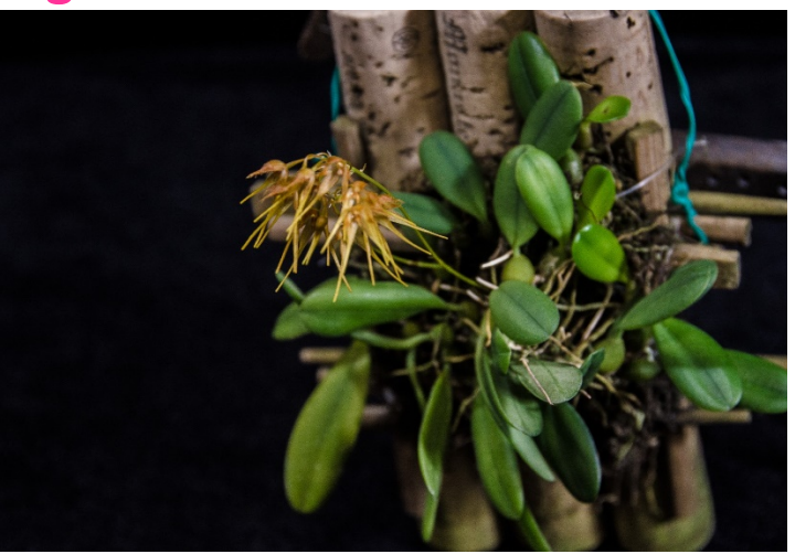
Bulbophyllum Taiwanese – <u>Unusual species</u>