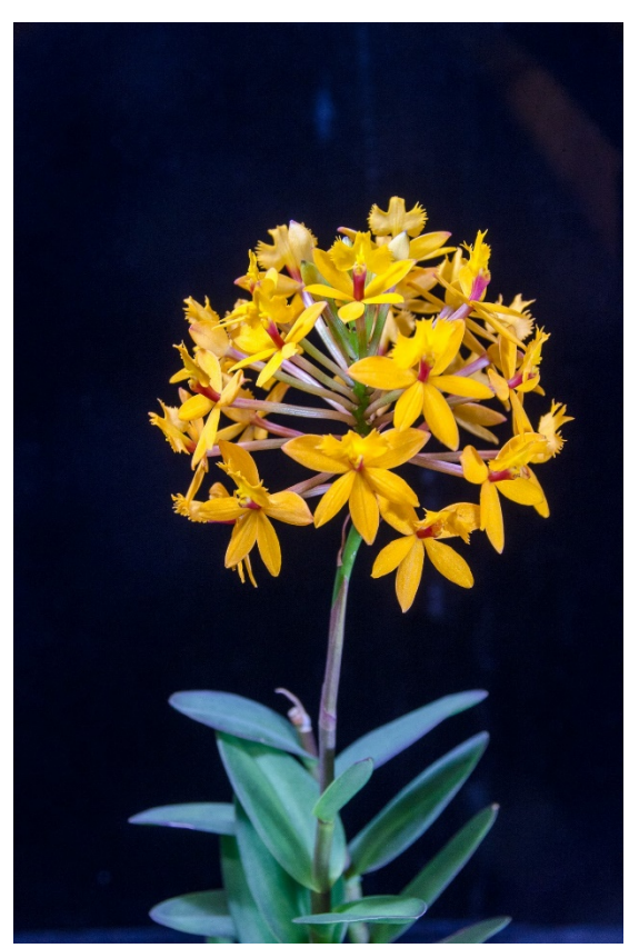
Epi. radicans – <u>Plant culture</u>, <u>flower quality & members' choice</u>

**<u>Editor's note</u>: This plant appears to have been incorrectly labeled – flower color is not consistent with a coerulea and the lip does not have the form of walkeriana, one of the parents.