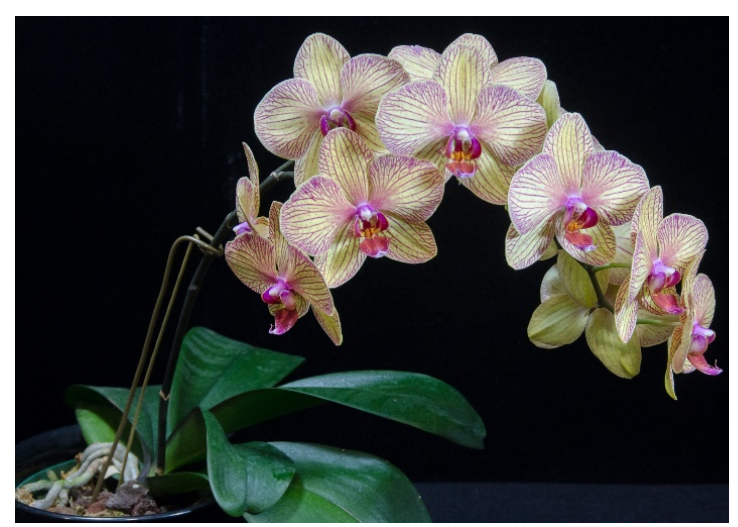
Phal. Baldan's Kaleidoscope 'Golden Treasure' – Flower quality and plant culture