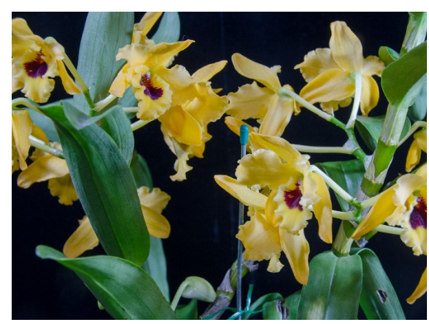
Den. Golden Crown 'Sunset' – Flower quality