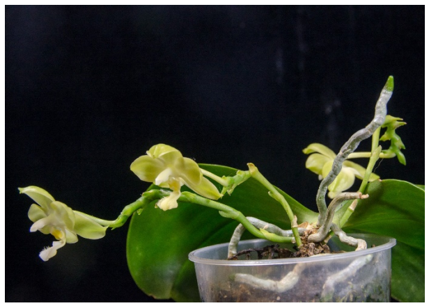
Phal. Violacea var. alba – <u>Plant culture</u>