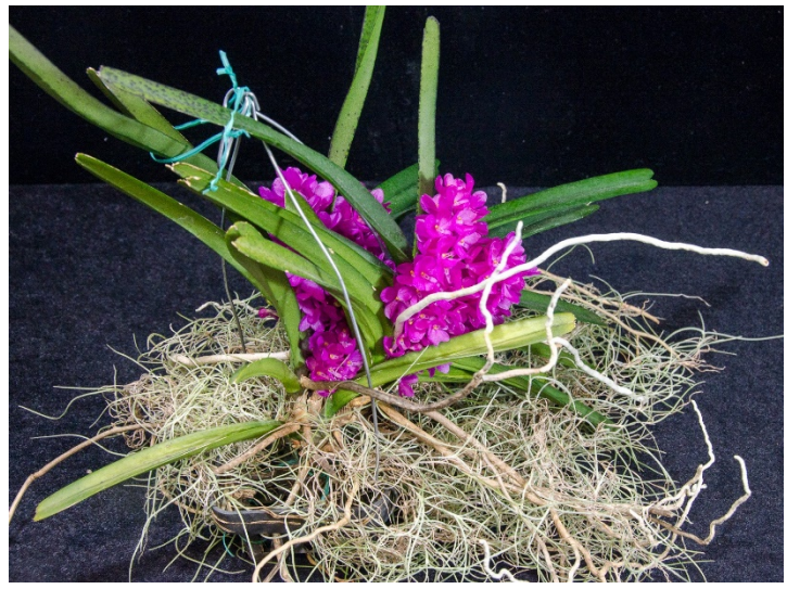
Ascocentrum ampullaceum – Flower quality & plant