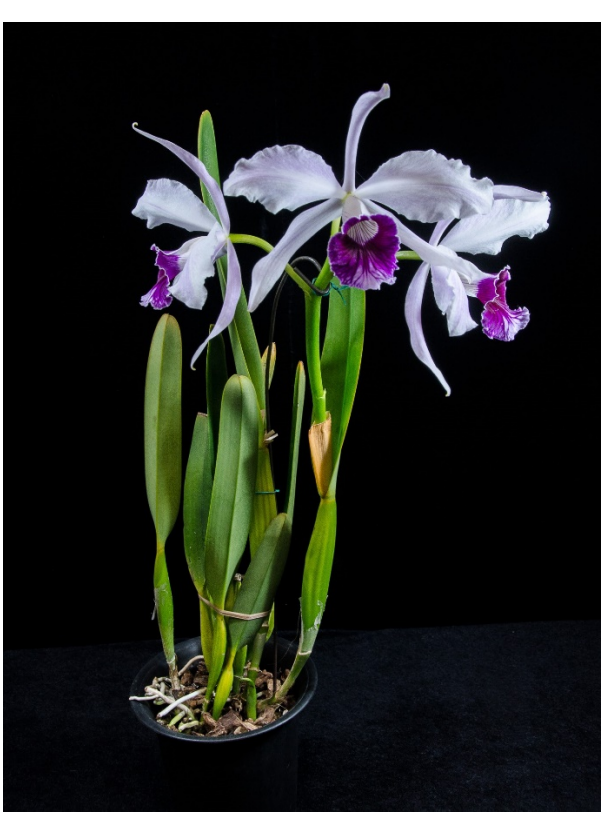
Laelia purpurata – Flower quality