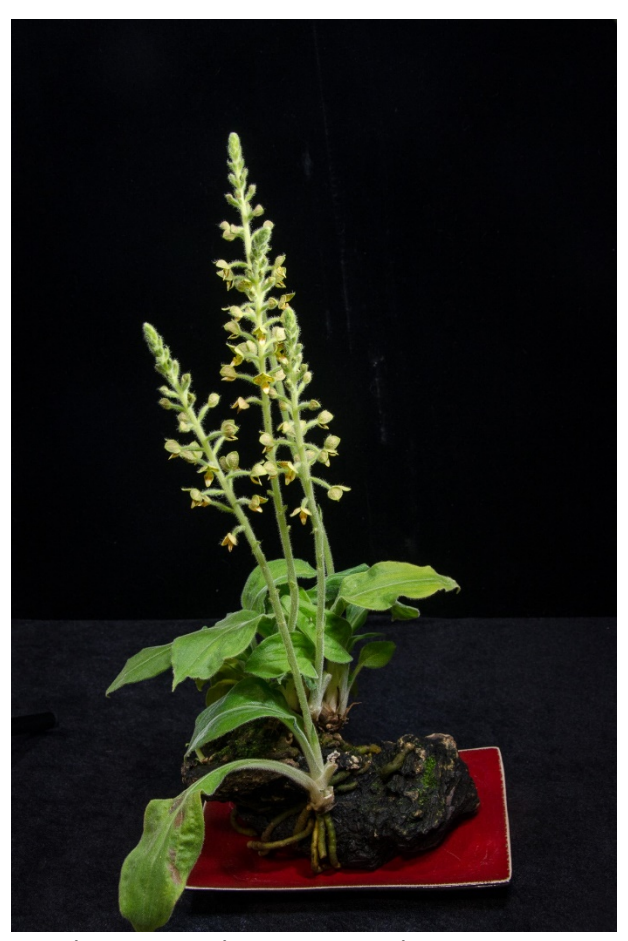
Ponthieva maculate – <u>Unusual species</u>