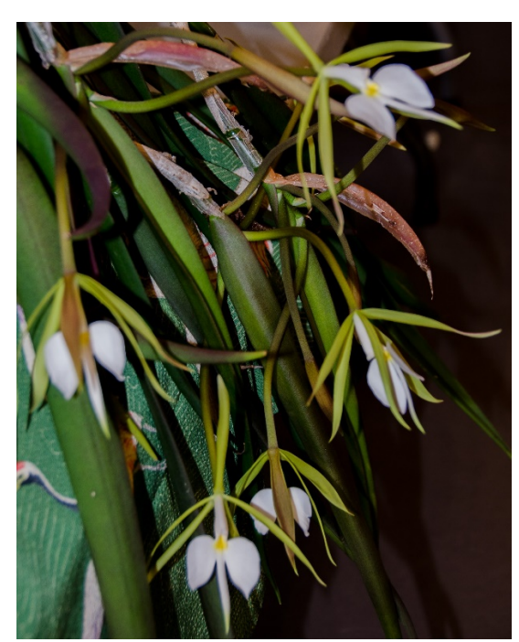
Epi. parkinsonianum 'Sydney Mei' – <u>Flower</u> quality