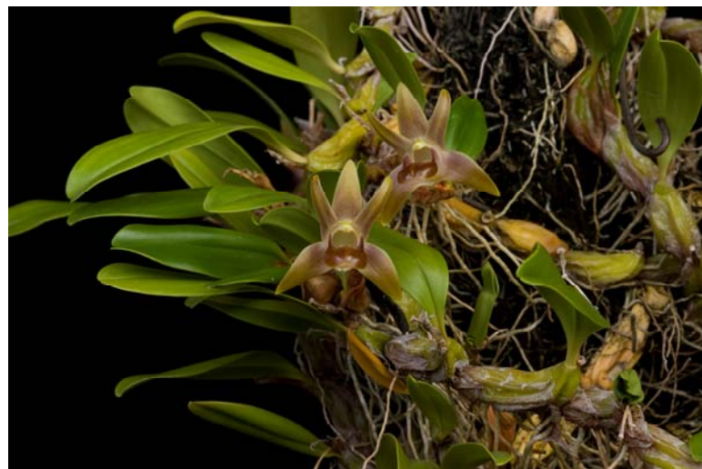
Plant Culture, Epigonium nakaharari 'Charlotte' HCC/AOS Grower: Rob Elvidge