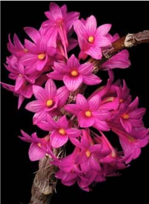
The beautiful flowers of Dendrobium goldschmidtianum range in color from deep fuchsia to soft pink.

Dendrobium goldschmidtianum is one of our favorite orchids because of ease of growth and the showy display it puts on every Christmas. Even better than that, it follows that December blooming with a slightly lesser one 6-8 weeks after that and can push flushes of flowers throughout the year. Flower color ranges from intense purple-violet to soft pink. Long known as Dendrobium miyakei Schltr., the species is a member of the Pedilonum section of Dendrobium which to this grower's mind, does not have any bad orchids. The Pedilonum section has many showy orchids in a rainbow of colors and wide range of temperature tolerances to suit any grower's conditions. See the Orchids AtoZ section of this website for other species. Pedilonum comes from the Greek word pedilon which means slipper or shoe. This refers to the long mentum, or chinlike projection, formed by the joining of the sepals. There was much confusion in the section, with species being known by several different names, until Dr. Elizabeth Dauncey's 1994 thesis which corrected much of the synonymy. There are about 47 species in the section with the center of distribution being Papua New Guinea.