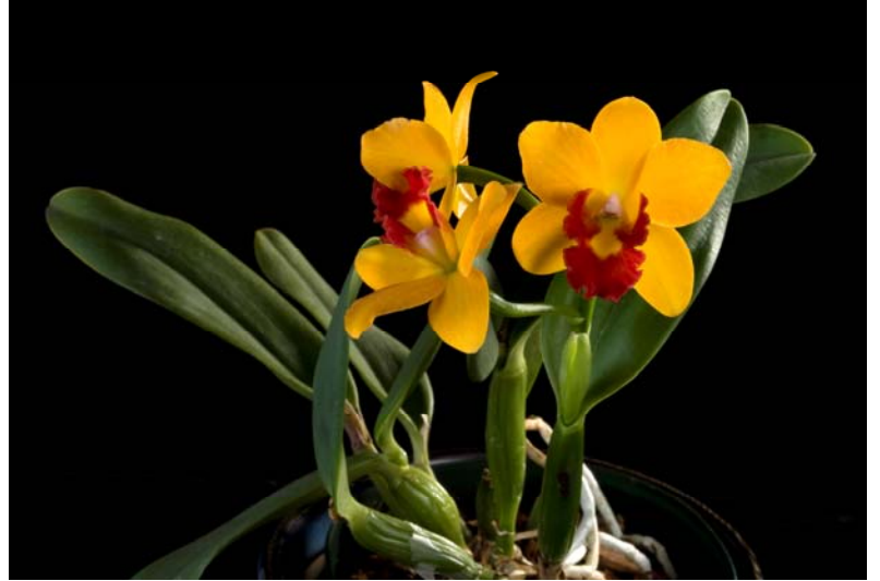
Plant Culture, SLC Jungle Beau