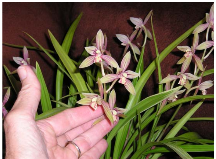
Cym. ensifolium 'Cai Hong'.