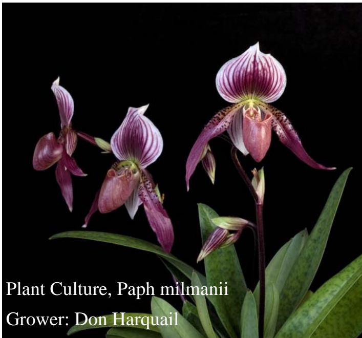
Plant Culture, Paph milmanii Grower: Don Harquail