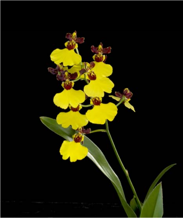
Flower Quality; Onc Moon Shadow ‘ Tiger Tail’