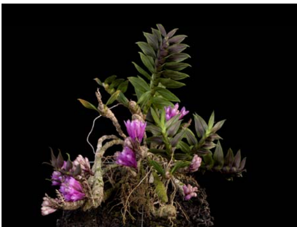
Best Orchid Mounted (slab) - Dend dichaeoides - Carla Bischoff