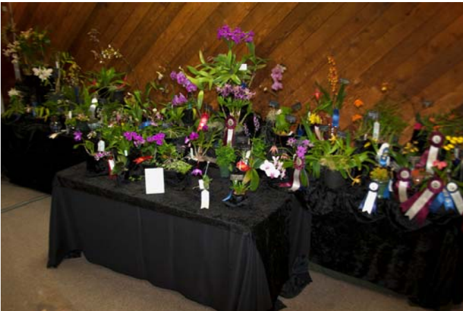
Best Visiting Society – Vancouver Orchid Society