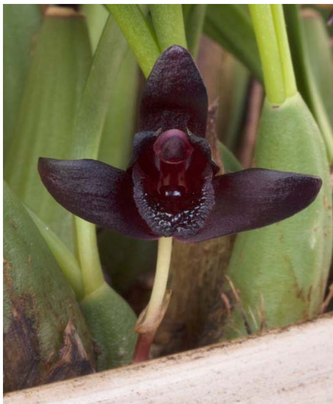
Species, Unusual species, Maxillaria schunkeana Grower: Rob Elvidge