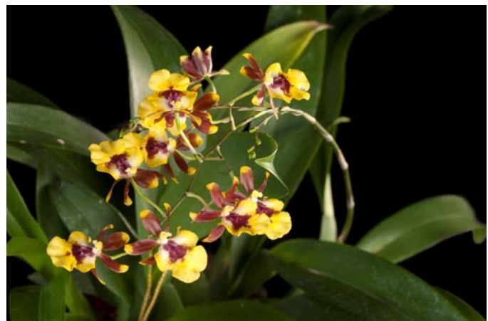
Best Orchid Grown on a Windowsill with no artificial light - Onc chaculatum – Roak Citroen