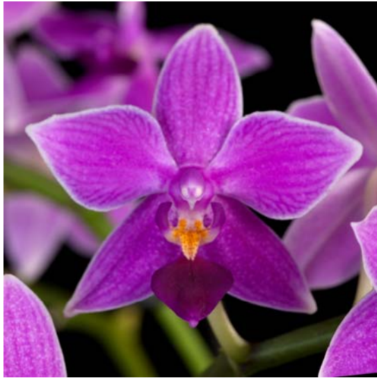
Best Phalaenopsis - Phal equestris Riverbend AM AOS – Don Harquail