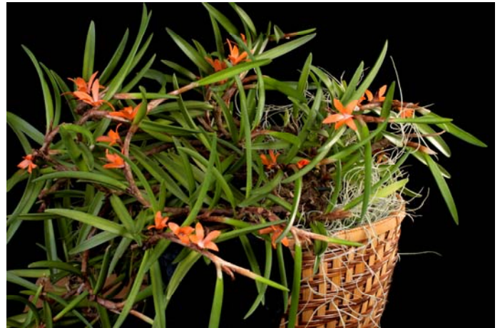
Best of all others 11.1 to 11.3 - Ceratostylis rubra – Carla Bischoff