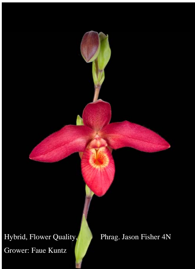
Hybrid, Flower Quality, Grower: Faue Kuntz